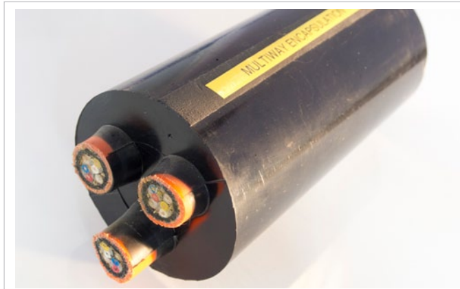
Encapsulation / subsea cable multiway