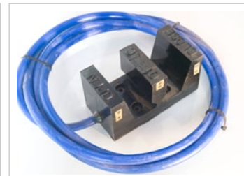
Moulding / cable / connector