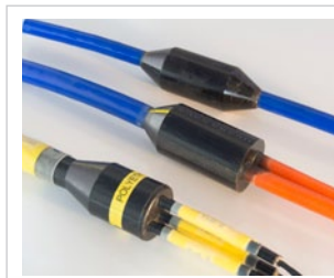
Encapsulation / cable