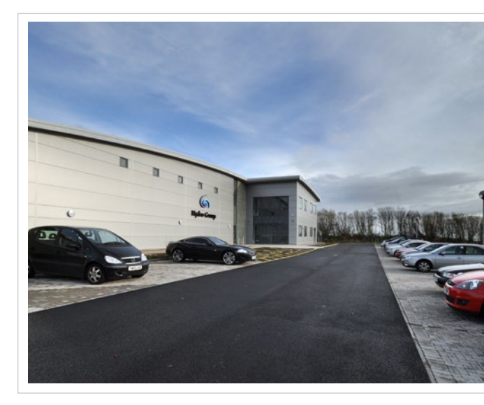
Manufacturing Headquarters in Aberdeen, Scotland

Hydro Group are at the forefront in the development and innovation of subsea product technologies, with involvement from prototype concept through to design, manufacture and project management. Hydro Group manufacture the complete package including FAT at its state-of-the-art facilities in Aberdeen, Scotland; umbilical cables, electrical, optical connection systems and assemblies for data, power and signal transmission.